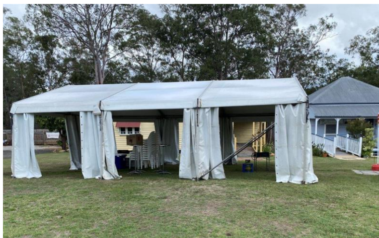
Before the Event

Skate Synergy Roller Sports Club Bundamba – To cover the cost of insurance and subsidise 24 weeks of training with an accredited coach who will volunteer his time. $ 5,000