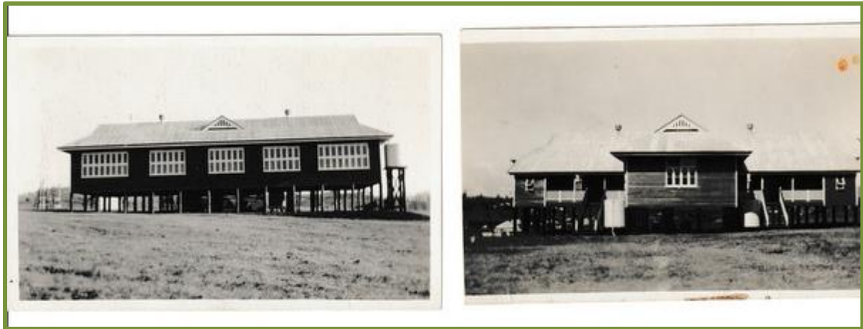
The 'new school' when it was built in 1920