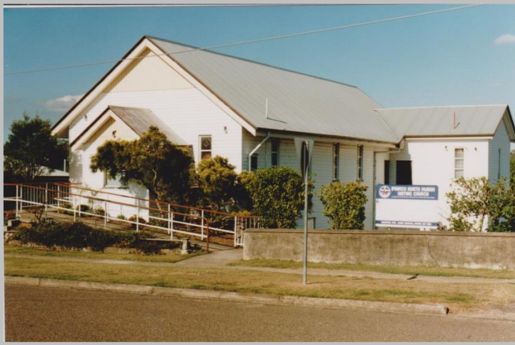
St Andrew's Presbyterian Church North Ipswich 1996