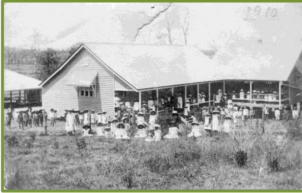
The original school, which stood on what is now the corner of Edmond and School Street

and the Domestic Science classes were continued until December 1963 when it closed. From this time the school was known once again as Marburg State School, as it had been prior to 1920, when the Rural School began.