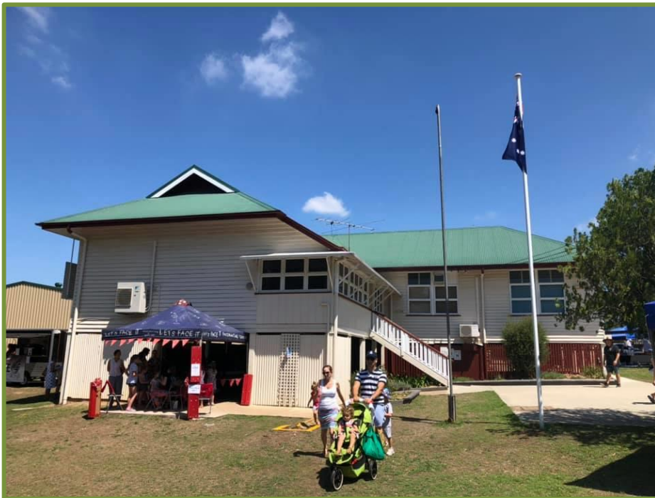
2019 – Marburg State School 140 year Anniversary – the main building.