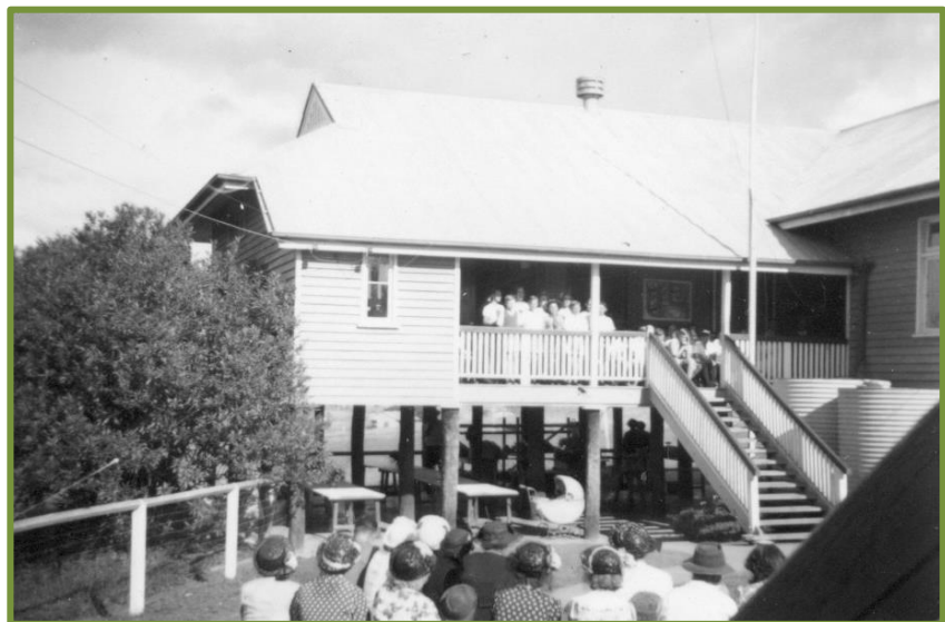
1954 – Marburg State Rural School 75 year Anniversary – the main building